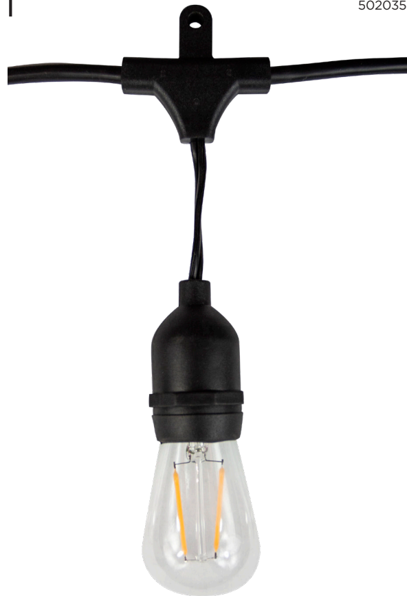
Part Number: LINE-VOLTAGE-BISTRO-STRING-KIT